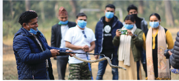
Capacity building of the local people