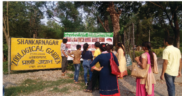
Community based conservation of snakes