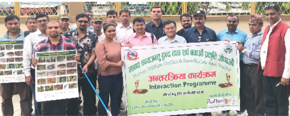
Snake Conservation Workshop & Awareness Programs