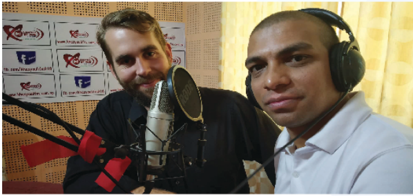
Radio Public Service Announcement (PSA)