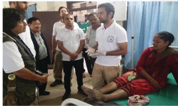
Mitigation of human-snakes conflicts