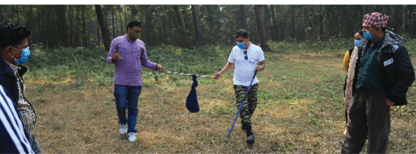
Rescue and Translocation of Snakes