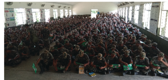
Foster support for snake conservation